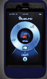
Some features and alerts can be accessed by mobile phone