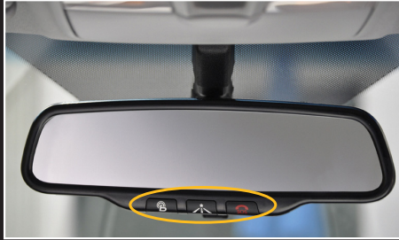
Some features are accessed in-vehicle