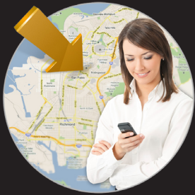
Point of Interest Search and Remote Vehicle Operation