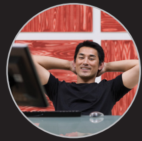
Vehicle Diagnostic Reports